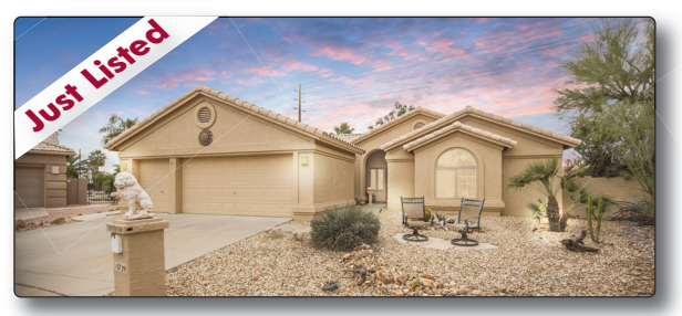
Sun Lakes • Ironwood 3BR, 2BA, 2123 sf, active adult community See Info and Video at 10729Coopershawk.com