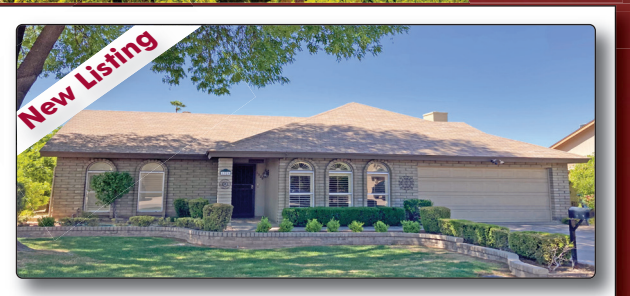
Tempe - 85283 - Great Location 3BR, 2BA, 2035 sf, formal areas, pool, wow See Info and Video at 1329Woodman.com