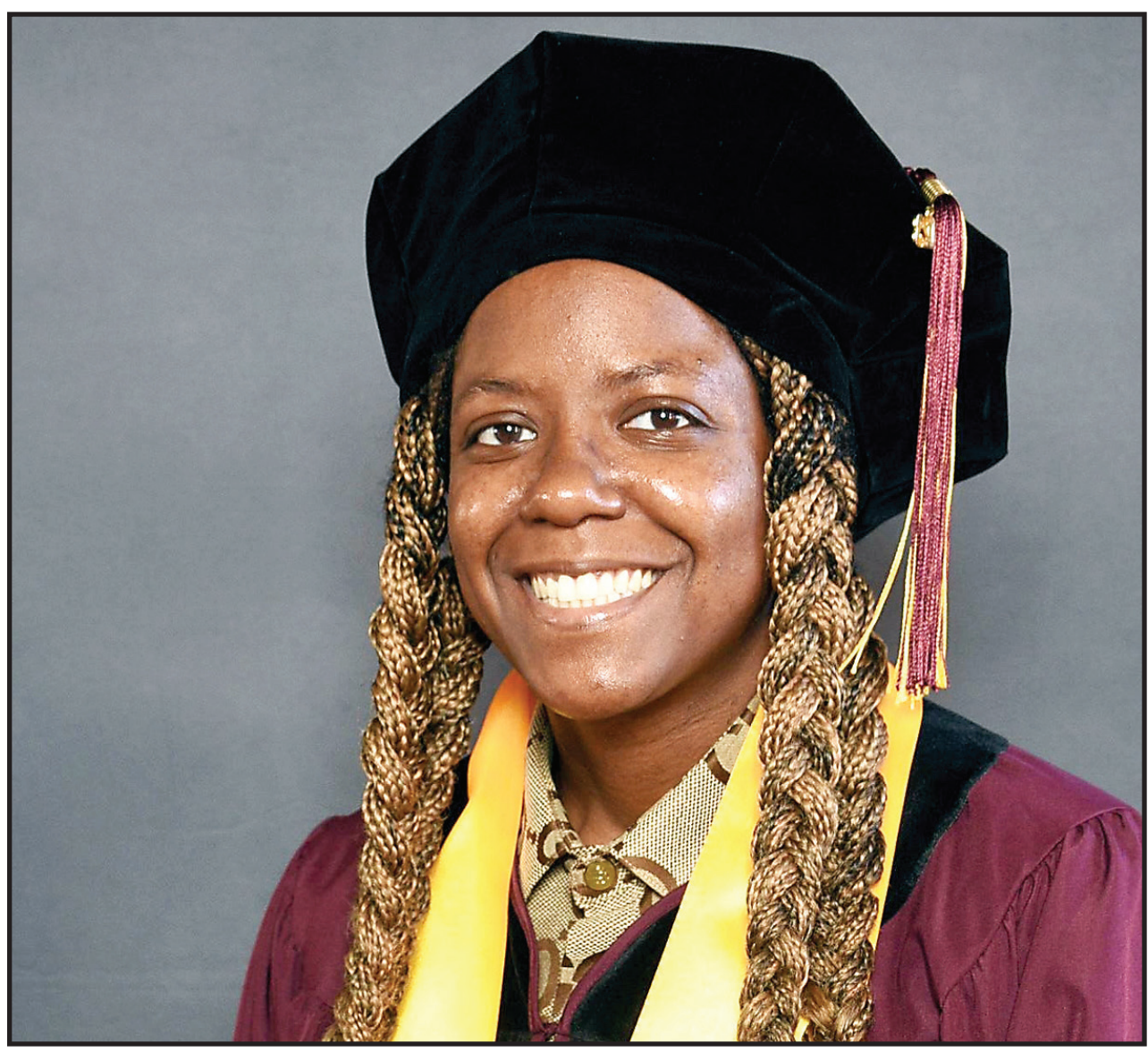
Following in her parents' academic footsteps, doctoral grad is uncovering new treatments for advanced cancer care.

And now, she is working on cancer treatments at the University of Arizona College of Medicine – Phoenix, in the Department of