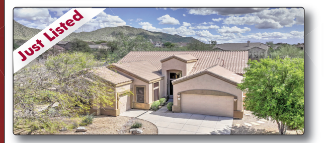
Mesa - Las Sendas - Special! 3BR plus den, 2.5BA, 2574 sf, resort-style living See Info and Video at 4163MorningDove.com